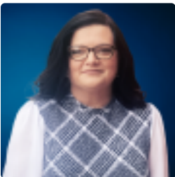
Summer Sweat Macon Universal Banker