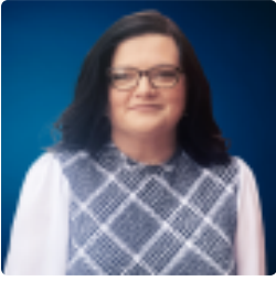
Summer Sweat Macon Universal Banker