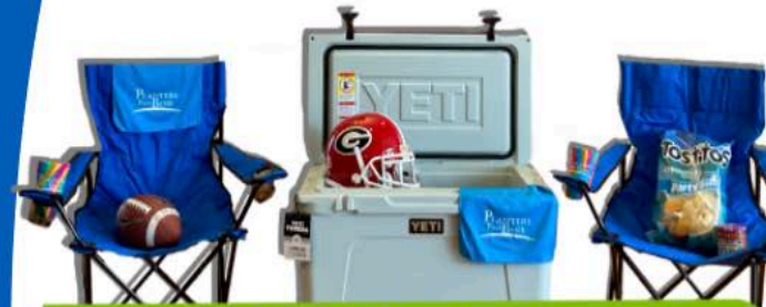
Yeti Cooler Tailgating Set

Anyone that successfully uses VIDEO BANKING in October will be entered into a drawing to win!